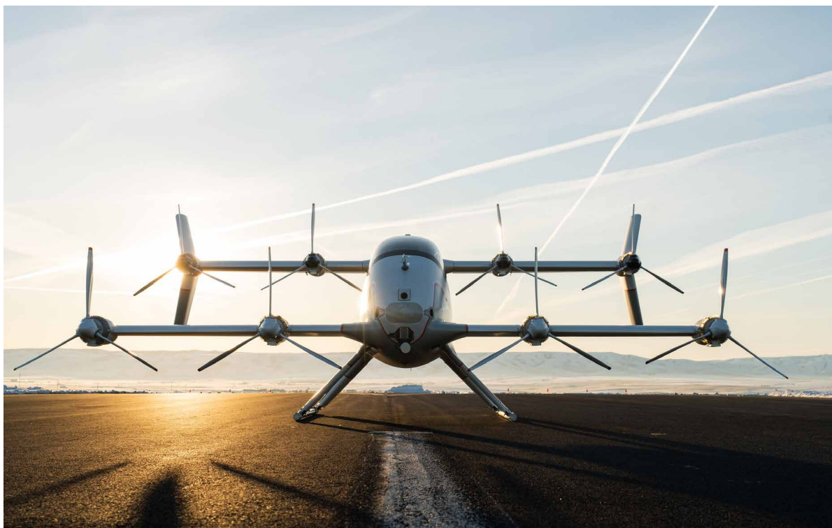
The Airbus Vahana. A 3

baselines and with varying degrees of complexity and scale. They must all be able to i) offer some form of collision avoidance; ii) deliver secure and high-integrity communications with the infrastructure; iii) ensure vehicle health monitoring and degradation management; and iv) be able to safely handle all contingencies. These technical solutions also have to conform to industry standards – meeting both national and international regulations and legislation – and be insurable to have a positive impact on society. A systems approach is needed to connect all the different disciplines, manufacturers and nations together.