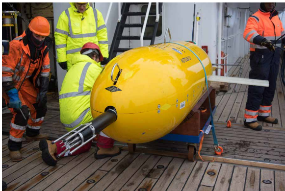
The autonomous submarine Autosub Long Range, affectionately known as 'Boaty McBoatface'.

All transport modes share the same basic systems architecture with each requiring sensors for situation awareness, a processing capability, actuators to control the vehicle and connection to the infrastructure. In a manned vehicle these functions are largely undertaken by the human but with increasing automation support (e.g. GPS, anti-lock braking, lane assist, etc. in a car); however, in a fully autonomous system these will all be undertaken by the vehicle. Most of the legal, social and ethical issues are common across the modes with the technical challenges differing only in the detail of the application.