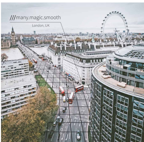
The what3words algorithm takes complex GPS coordinates and converts them into unique three-word addresses.